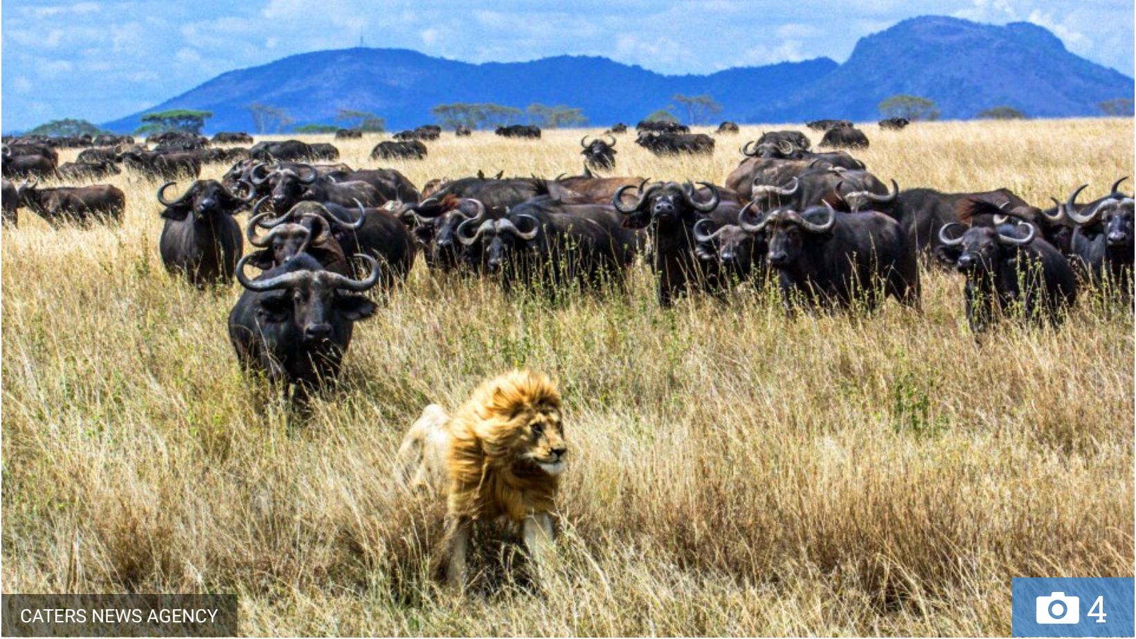
The lion walked away with its tail between its legs

“Slowly the buffaloes were approaching to where the trio was laying camouflaged in the grass.