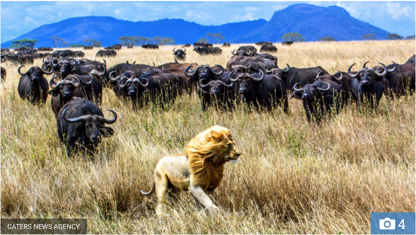
The giant beast was no match for the gang of horned buffalo

“There were two attacks in about 10 minutes. The first attack was on the couple who were a bit further away from us but the second buffalo attack was closer to our car and the buffalo charged the single lion.